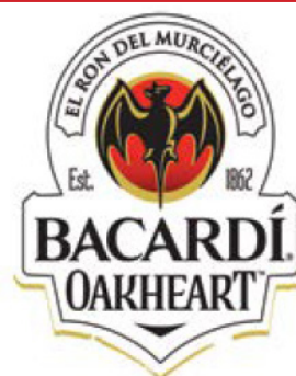
Artwork NOT Embedded