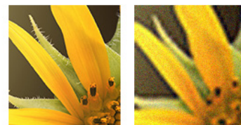
300 DPI at size 10 DPI at size