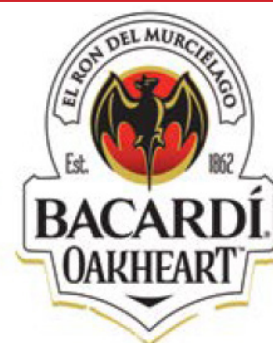
Artwork NOT Embedded