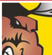
300 DPI at size

Composed of pixels, tiny colored squares grouped together to make one big image. When scaled larger, image will look jagged or "pixelated."