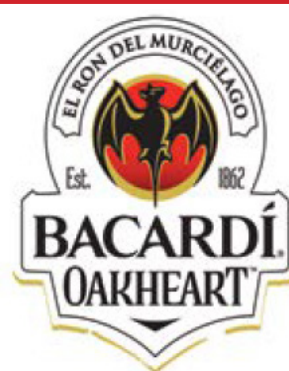
Artwork NOT Embedded