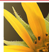
300 DPI at size