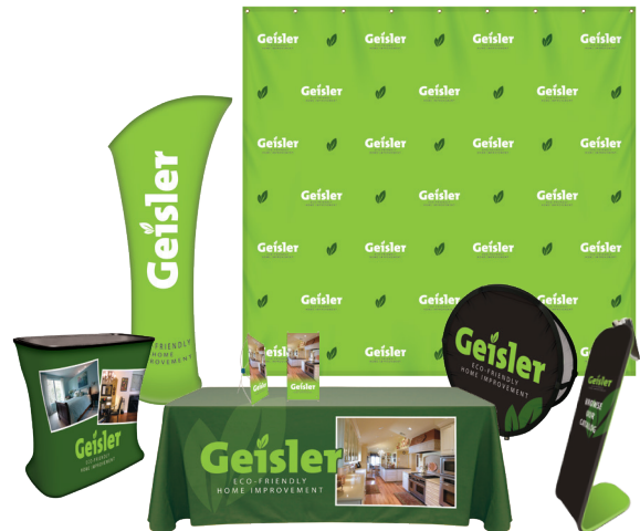
Booth in a Box Package D BIB-D

Includes: Transformer Trunk, X-Banner, Mini X-Banner (2), 6' Portable Teardrop Banner w/Cross Base, 6' Stretch Table Cover, SlimFit Wall, LED Clip Lights (2)