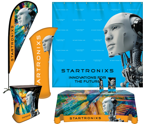
Booth in a Box Package B BIB-B

Includes: Transformer Trunk, SlimFit Wall, X-Banner, 6' Stretch Table Cover, Mini X-Banner (2)