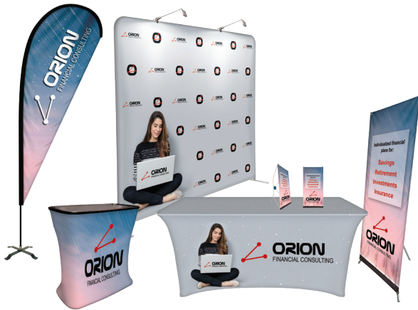
Booth in a Box Package C BIB-C

Includes: Transformer Trunk, X-Banner, Mini X-Banner (2), 6' Portable Teardrop Banner w/Cross Base, 6' Stretch Table Cover, SlimFit Wall, LED Clip Lights (2)