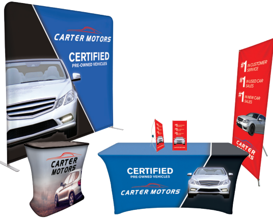
Booth in a Box Package A BIB-A

Includes: Transformer Trunk, SlimFit Wall, X-Banner, 6' Stretch Table Cover, Mini X-Banner (2)