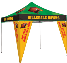
Tent corners 6.5' tents - CPT-65CBS 10' tents - CPT-10CBS 20' tents - CPT-20CBS

Make your Tent even more customizable with these display options