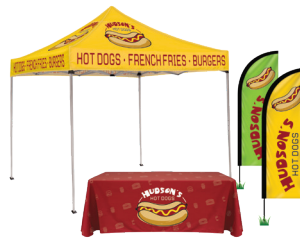
Tent package B CPT-6001Z