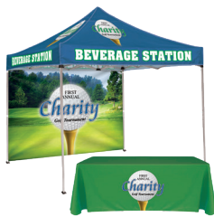
Tent package G CPT-6006Z