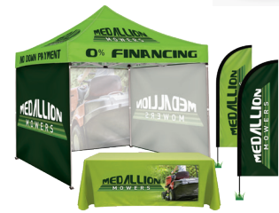
Tent package J CPT-6009Z