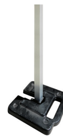
Tent leg weights CPT-5001T2