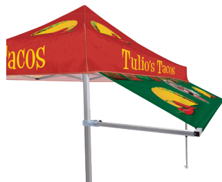
Tent awning for heavy duty tents CPT-1010AWNING