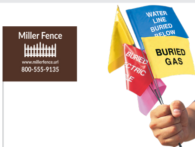
Marking flags as low as $0.16 R