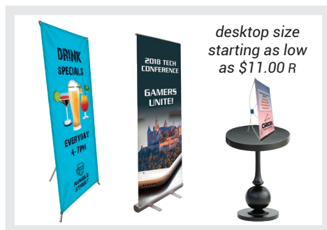
X-Banners & retractable banners as low as $73.25 R