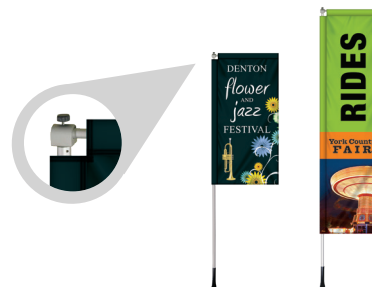
Windchaser flags as low as $77.65 R