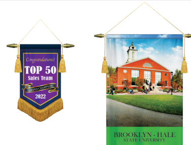
Podium banners as low as $7.32 R