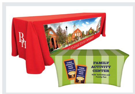
Premium polyester table covers as low as $128.00 R