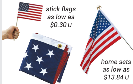
American flags flags as low as $1.50 U