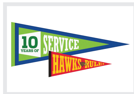
Felt pennants as low as $1.10 R