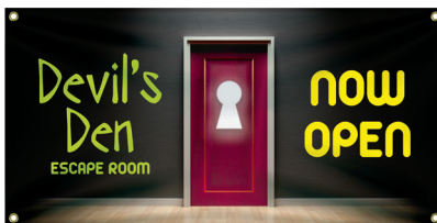
Vinyl & polyester banners as low as $34.80 R