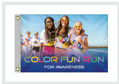
Outdoor & promotional flags as low as $3.70 R