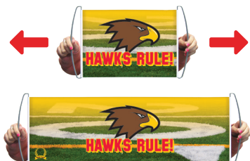
Scroll banners as low as $2.20 R