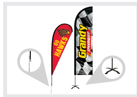
Portable banners as low as $103.70 R