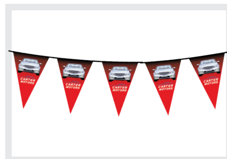
Pennant strings as low as $22.00 R