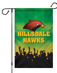
Garden banners as low as $13.15 R