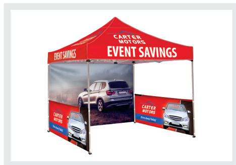
Tents as low as $490.00 R