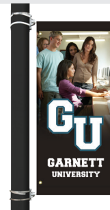
Avenue banners as low as $46.60 R