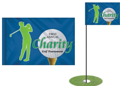
Golf flags as low as $12.45 R