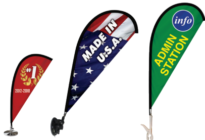
Mini teardrop flags as low as $16.20 R