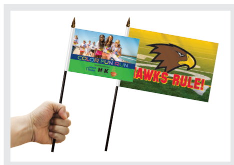
Stick flags as low as $1.88 R