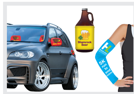
Stretch polyester products as low as $2.90 R