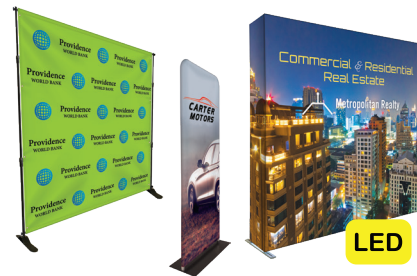
Display products as low as $275.78 R