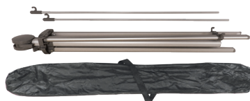
hardware and carrying bag

Trade Shows POP Restaurants and much more