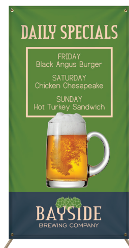
31" x 60" X-Banner XBS-2002T2K