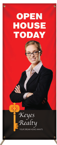
24" x 60" X-Banner XBS-2001T2K