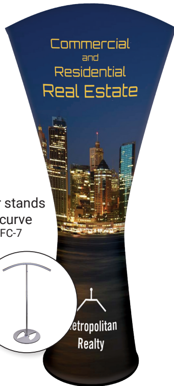
Tower stands full curve TSFC-7

includes ground spikes for use on soft surfaces