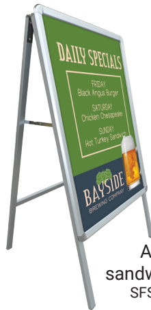
A-Frame sandwich boards SFS-2000T2K