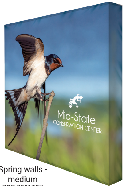
Spring walls - medium POP-2001T2K