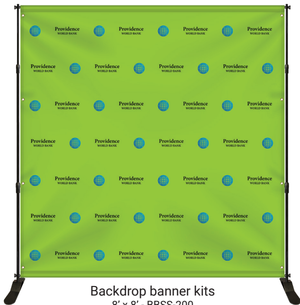
Backdrop banner kits 8' x 8' - BBSS-200 10' x 10' - BBW-2001T2K