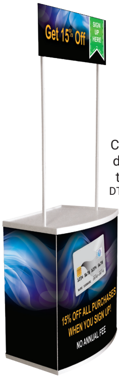
Custom display tables DTPOP-01