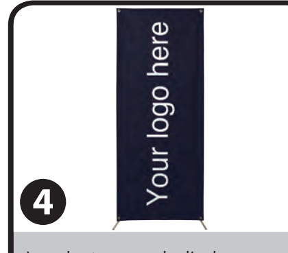
In order to properly display your banner on the X-Banner body piece, raise the telescoping pole until taut.

Using your banner with grommets, attach each of the four corners to the X-Banner hooks, starting with the top first.