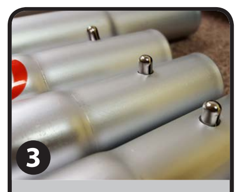
To connect tubes depress the button and slip connecting tube over top and align with hole to secure.