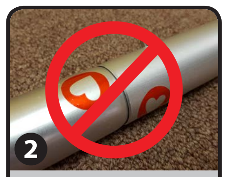
Mismatched symbols will not yield desired shape of tubing. Symbols must be in the same direction and same side.