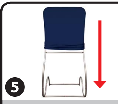
Slip graphic over the top and down onto the display smoothing as you go for optimal finish.