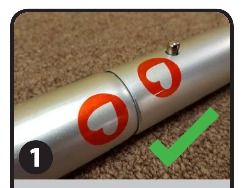
Match up symbols on each tube. They must be in the same direction and same side.

Includes: 7 Straight tubes 2 Connected 3-piece curved tubes 4 U-shaped tubes 2 90-degree tubes Graphic Carrying bag