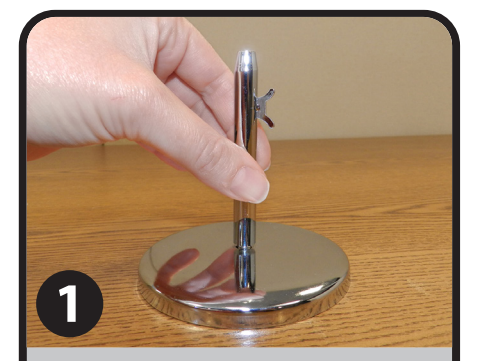
Screw the metal post into the weighted screw base by turning the peg clockwise.