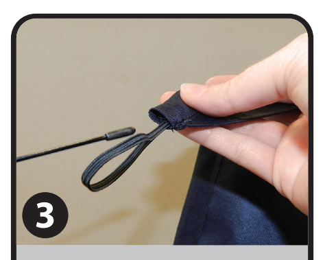
Slide the banner onto the pole via the pole sleeve, starting with the rounded rubber tip. Note: Be sure to feed the pole all the way through the sleeve to the tip of the banner.