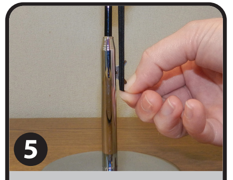
Connect the loop at the bottom of the banner to the attachment hook on the metal post to secure the banner in place.