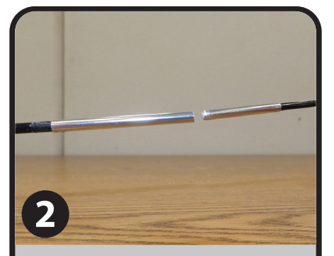
Connect the sectional pole pieces together by sliding the metal end of the small pole into the open end of the large pole.