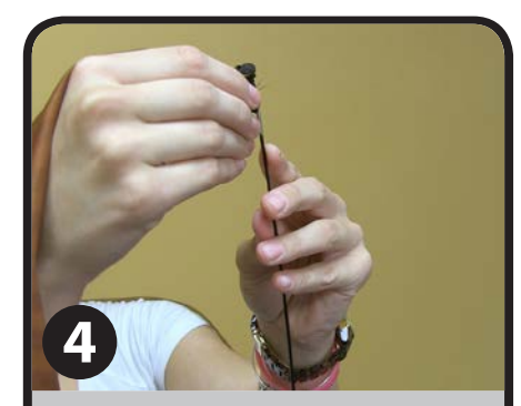
Slide the banner onto the pole via the pole sleeve.

Note: Be sure to feed the hardware all the way through the sleeve, to the tip of the banner.