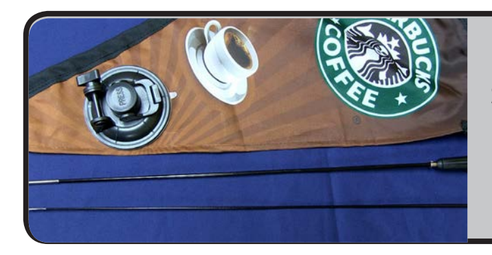
Includes: Sectional Pole Heavy Duty Suction Cup