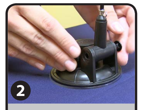
Take the sectional pole piece with the cylinder base and attach it to the suction cup base. Run the screw through the base of the pole piece and tighten the knob to secure it in place.