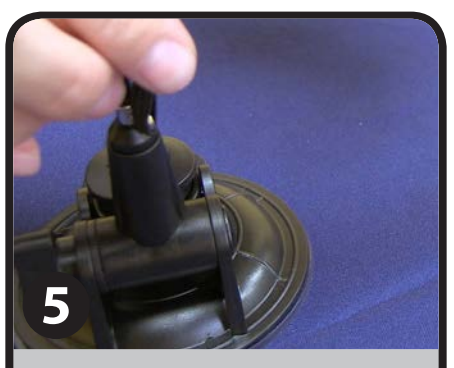
Attach the loop at the bottom of the banner to the knob on the suction cup base to secure the banner in place.

Note: Be sure to feed the hardware all the way through the sleeve, to the tip of the banner.