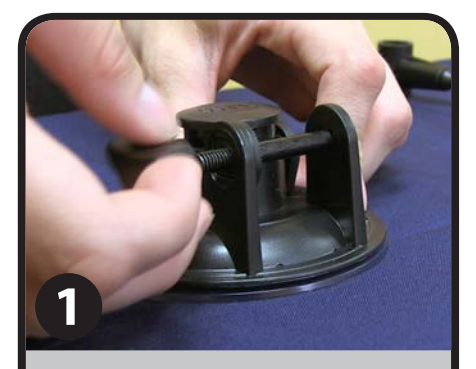
Turn the knob on the suction cup base counter-clockwise to loosen it. Remove the knob and the screw.