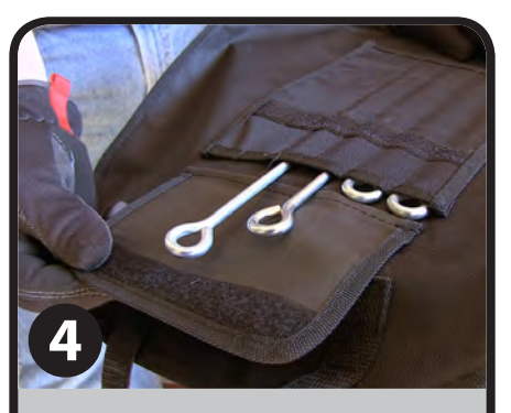
If you would like to secure the Pop-Up Banner to the ground, use the four ground spikes provided (additional tools may be needed for this).