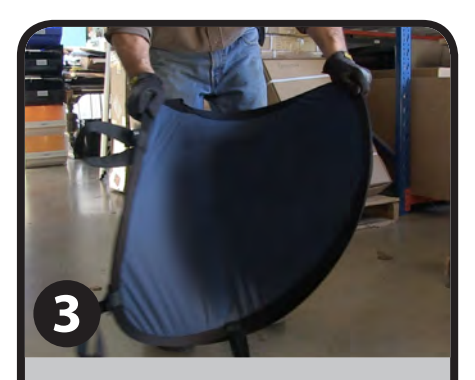
Begin to fold the outside edges inward, using your wrists to gradually fold the top towards the ground.

Note: Using your foot to prop up the Banner can be helpful.