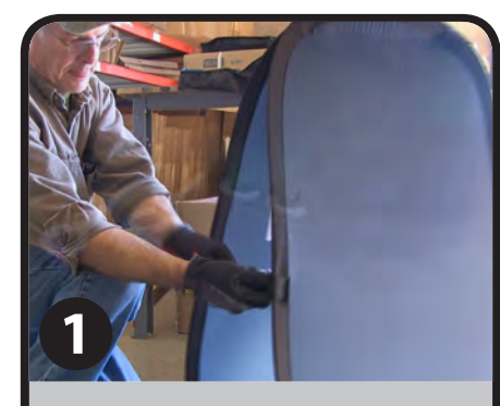
Detach the two Velcro strips along the base as well as the two strips along the sides.