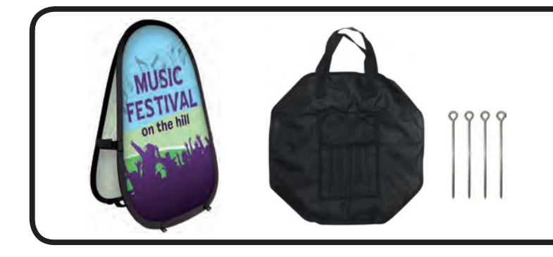
Includes: Pop-up banner Carrying bag 4 ground spikes