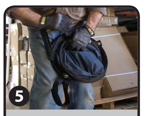
Fold each side inwards and the Banner should fold into three circular sections.