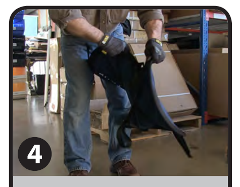
Continue to fold the top towards the ground, making sure that the top ridge of the Banner is within the lip of the bottom ridge.