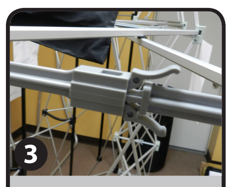
Interlock central, front-side and back-side hooks followed by hooks on top then bottom. This may require assistance. For greater leverage, lay the frame flat on the floor to interlock hooks.