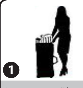
Remove spring wall from carry case.

Includes: Frame Banner Black Canvas Carrying Bag