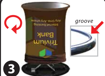
Table will automatically rise to the fully open position.