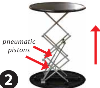
Table will arrive in closed position. To determine top and bottom, pneumatic pistons should extend upward (see step #2). Place the bottom panel on the floor. Place hands under opposite sides of the top panel and gently pull upwards.