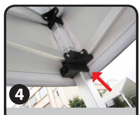
Engage the auto slider at each corner by pushing up with one hand while holding down top of leg with the other hand. Snap button will engage in groove. Repeat on all other legs.

Expand frame out fully by having each person move to the middle leg of the 20' side. Grasp at bottom of the v. Lift up and step backwards at the same time until tent is fully opened.