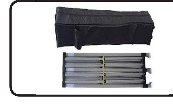
Includes: Tent Frame Carrying Case with Wheels Canopy Graphic