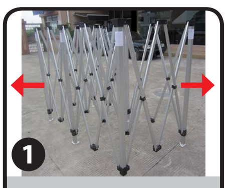
Place tent frame in center of final place. Remove strap and have two people stand on opposite sides, grasping the outer legs. Lift off of ground and step backwards, stopping when about 1/4 expanded.