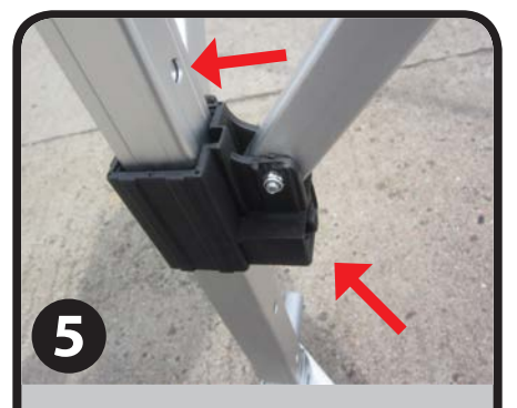
Lift two adjacent outer legs and pull out the inner legs until you reach the snap locks. Repeat on all legs. Raise or level the tent using adjacent holes found near bottom of each leg.